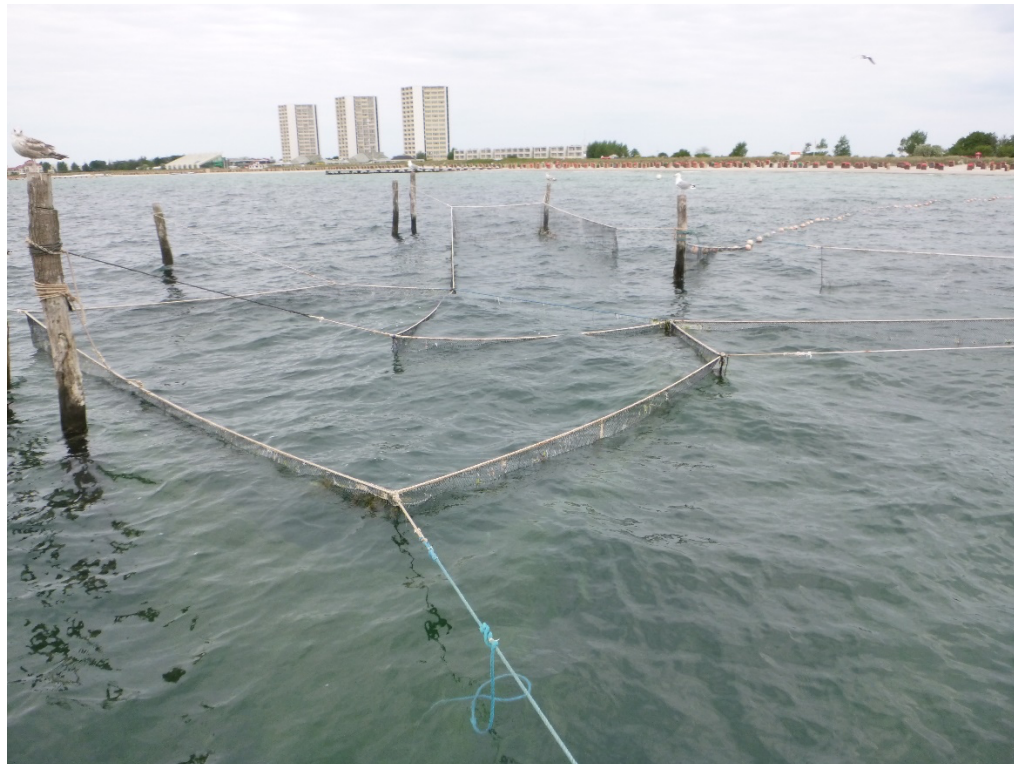
Figure above: A commercial pound net near the mouth of Burgstaaken harbour, Fehmarn, Germany (Baltic Sea); from front to back: first chamber, wings and guiding net or leader (with white buoys), beach. Buoys at the head line and weights at the lead line force fish to enter the catch chamber (mesh size 12mm) at the seaward end. The catch chamber is stretched by ropes attached to fixed pillars (see figure above).

For more details, please refer to pages 293-310 of